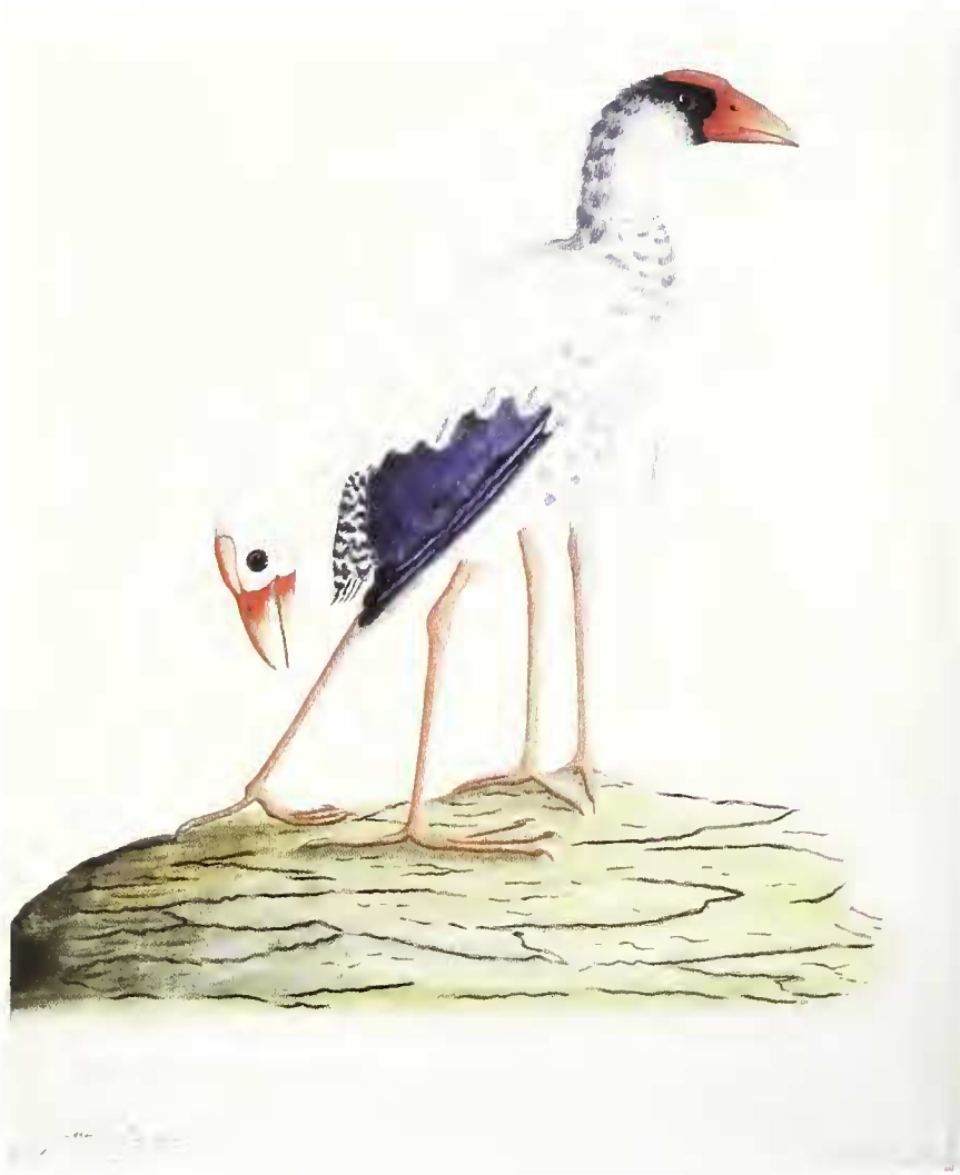
Figure 5. Illustration of two Lord Howe Gallinules Porphyrion albus , one all white and one still variegated, by George Raper (1790); this painting is particularly important as it clearly shows two stages of the colour aberration progressive greying (Alexander Turnbull Library, Wellington)

are furnished with a small crooked spine. In the dried specimen the legs and feet are yellow; but, perhaps, in the living bird might have been of the same colour with the beak.'